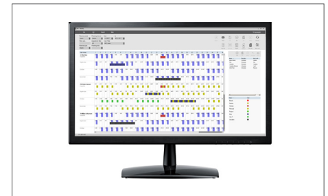
TimeMoto PC Software Plus Art.no: 139-0600