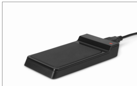
TimeMoto RF-150 USB RFID Reader Art. no: 125-0605