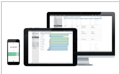
TimeMoto Cloud / TimeMoto Cloud Plus Art.no: 139-0590 / 139-0591