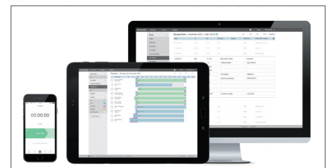
Or TimeMoto Cloud (30 days included)